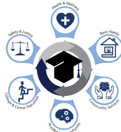
TCP's Wraparound Services Model

Our mission is to make equity actionable by assisting schools to ensure all students have equitable access to services and opportunity.